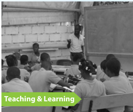
Teaching &amp; Learning